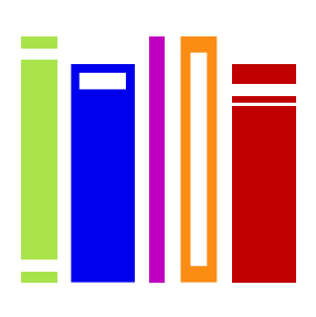
51,352 Physical Circulation