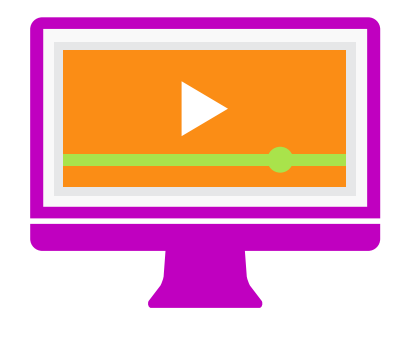
5,593 Views of Recorded Programs