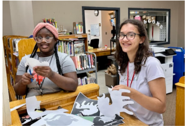
Teen volunteers prepping for Summer Reading Kickoff Party